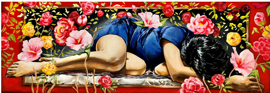
Sue Park - Year 12 student