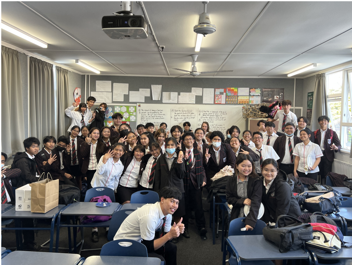
Filipino students enjoying a shared lunch together.