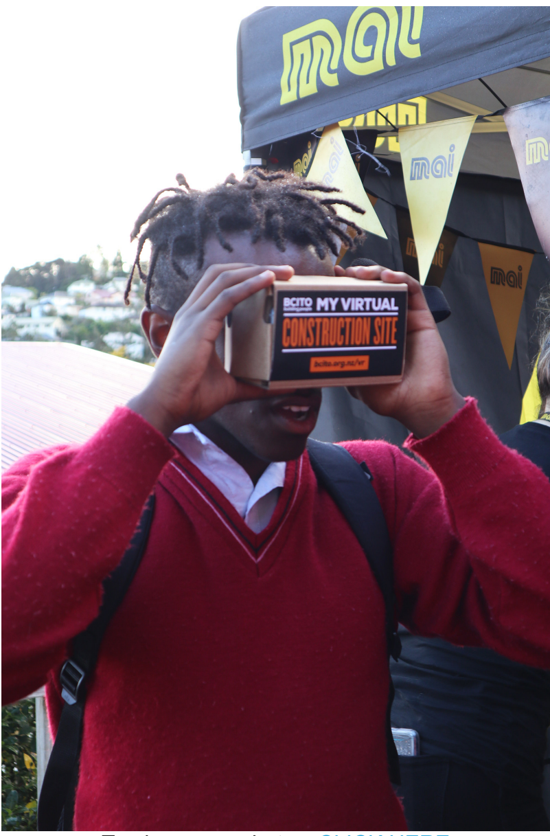
To view more photos, CLICK HERE