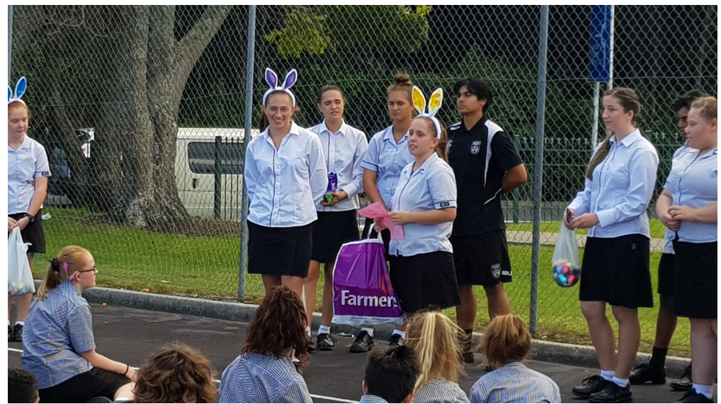
To view more photos, CLICK HERE